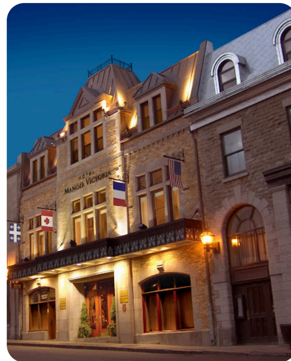
Hotel Manoir Victoria (Quebec City) 44 Côte du Palais, Québec, QC