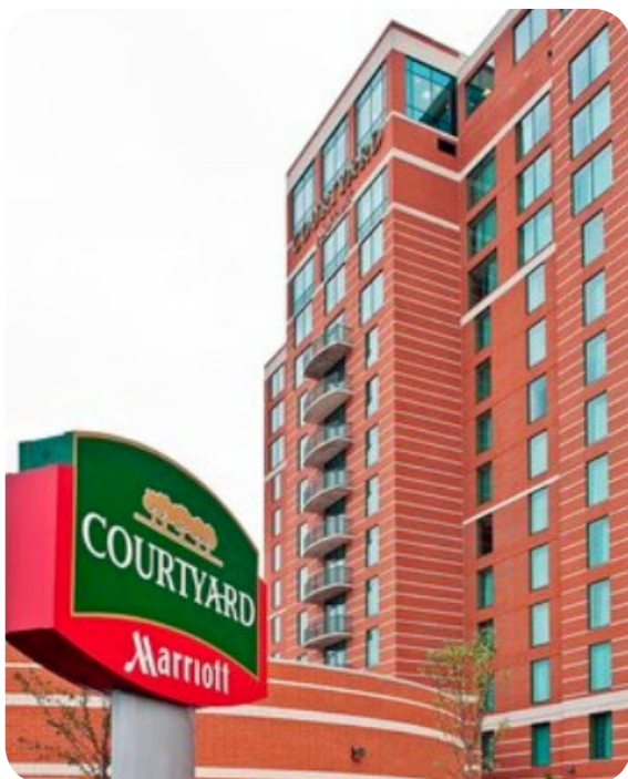
Courtyard Ottawa East 200 Coventry Rd, Ottawa, ON