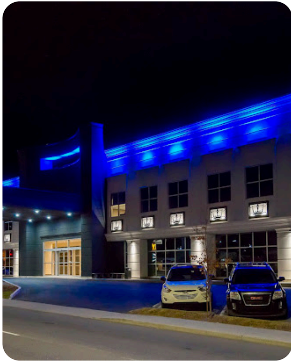
Hotel & Suites Le Dauphin Drummond Ville 600 Bd Saint-Joseph, Drummondville, QC