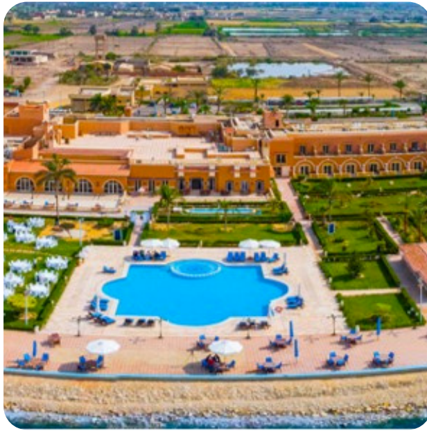
Helnan Auberge Fayoum