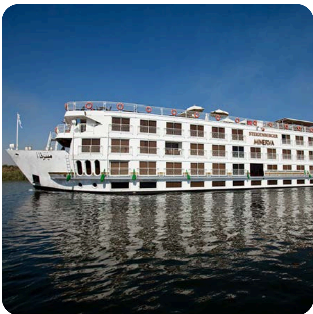
MS Steigenberger Minerva