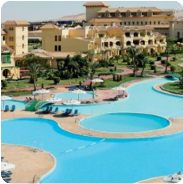
Mövenpick Cairo Media City